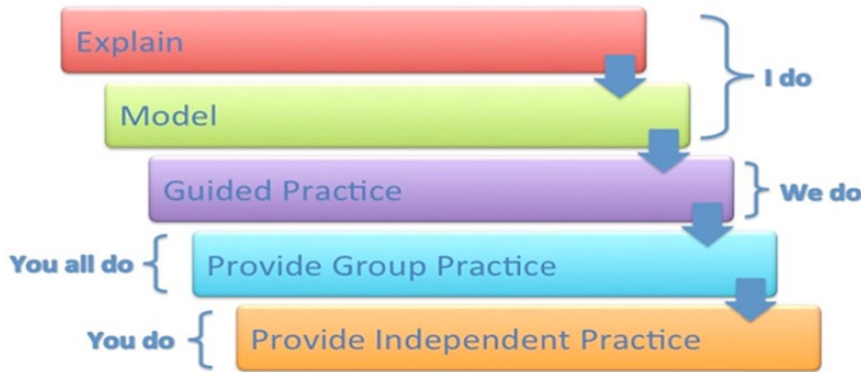
Figure 1. Gradual release model of teaching

background knowledge. Skills that are taught later in the year include inference making and comprehension monitoring and repair. This developmental approach is based on early research (Blank, Rose, & Berlin, 1978) that indicated that language develops from literal to inferential. Comprehension questioning can also be organized in this way so that easier types of comprehension skills are taught and mastered before inferential questions. In reality, it is likely that successful comprehension requires many strategies working in concert and that the development of these strategies is not linear. The goal of teaching the strategies in this particular order is to allow children to begin to develop more basic competencies, before moving on to more difficult and abstract strategies. When planning comprehension instruction, teachers should think about comprehension instruction as being cumulative; that is, new strategies build on and extend previous ones. It is likely that all students, even those who are not struggling readers, benefit from this type of explicit and systematic comprehension instruction. Therefore, we suggest that comprehension strategies be introduced in whole-class settings, with extended practice and direct instruction provided in small groups for students who are in need of supplemental Tier 2 instruction.